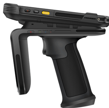
UHF Sled Reader